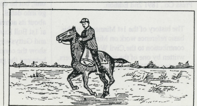
ARMY MAIL CARRIER.

The 81st Indiana was mustered into service Aug. 20, 1862, 932 men strong. It was sent to Louisville, KY where it stayed until it joined Buell's army in pursuit of Bragg. Its first major battle was at Murfreesboro where it lost 4 killed, 44 wounded and 40 missing. It next took part in Rosecrans campaign of maneuver during the summer of 1863 which culminated at the Battle of Chickamauga, where it lost 8 killed, 59 wounded and 22 missing. In 1864 it participated in most of the major fighting during Sherman's Atlanta Campaign. In the fall of 1864 it took part in the battles of Franklin and Nashville. The 81st was mustered out June 13, 1865 after losing 236 members by death, 33 by desertion and 8 missing.